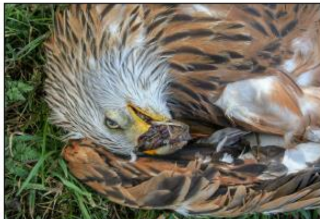
A once magnificent Red Kite hunted and killed.